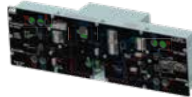
Quantum12™ HGD 1.2GHz System Amplifier