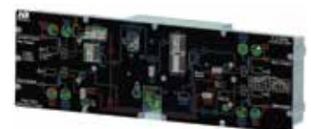
Quantum12™ HGBT 1.2GHz System Amplifier